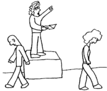
I HAVE EVANGELISED WITH THE EVANGELICALS