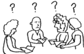
I HAVE QUESTIONED WITH THE LIBERALS

I THINK NOW I WILL STOP AND HAVE SOME TEA