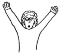
I HAVE WORSHIPPED WITH THE CHARISMATICS