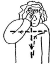
I HAVE CROSSED MYSELF WITH THE ANGLO-CATHOLICS