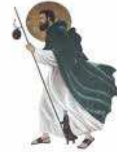
An image of St James on his missionary work

Welcome to all our visitors. Let us worship and grow together as branches of the true vine.